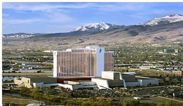
SUMMIT GRAND SIERRA HOTEL, RENO NEVADA

What a great place to hold a reunion and the deadline of July 31, 2010 for registering is fast approaching so if you haven't signed on as yet, don't wait another minute!! Just make sure you mention the "Markab Reunion" when you make your reservation. Call now: 1-800-648-5080.